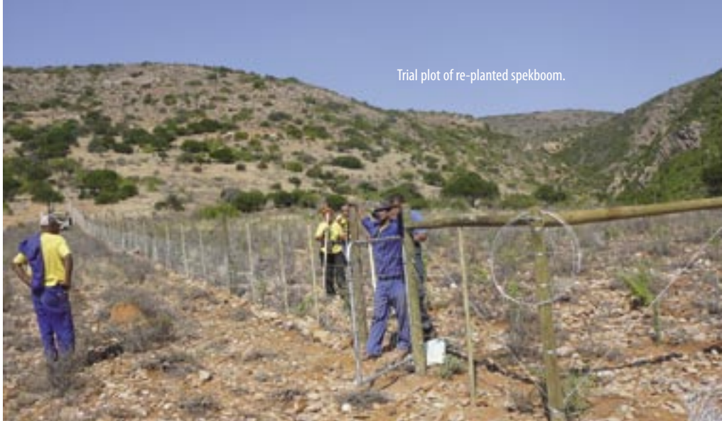
Trial plot of re-planted spekboom.

Ultimately the potential benefits of restoration to degraded thicket landscapes are enormous environmentally, socially and economically: increased wildlife carrying capacity, reduced soil erosion, improved water retention and infiltration in the soil, and the return of biodiversity, while earning carbon credits on international markets which can provide employment and income to rural communities. Surely a win-win-win situation! 🌱