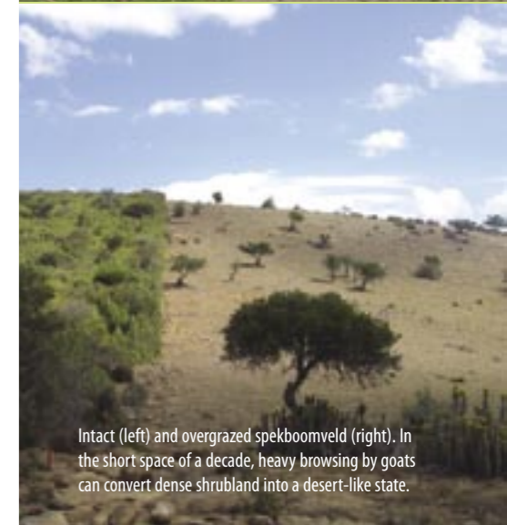
Intact (left) and overgrazed spekboomveld (right). In the short space of a decade, heavy browsing by goats can convert dense shrubland into a desert-like state.