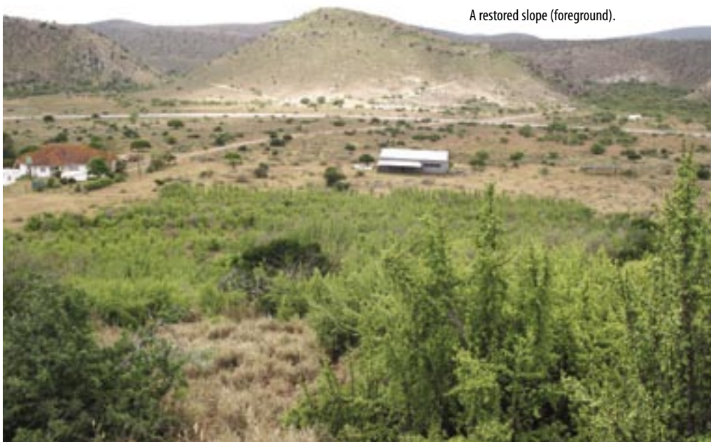
A restored slope (foreground).