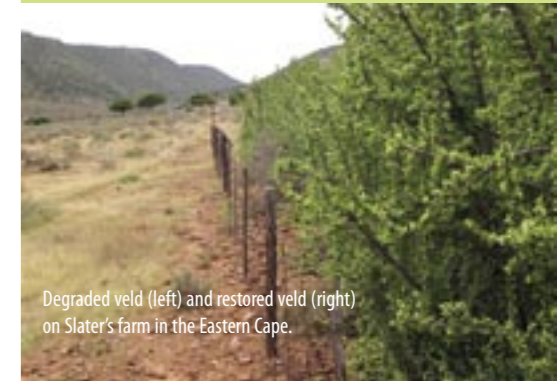
Degraded veld (left) and restored veld (right) on Slater's farm in the Eastern Cape.